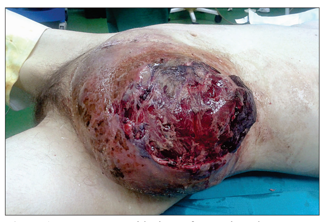
Figure 1. Large tumor, with signs of necrosis and hemorrhage, completely infiltrating the full thickness of the lower abdominal wall and necrosis of the covering skin

Indication for elective operation was established and median laparotomy was performed. Intra-operative finding was bulky tumor with size of a child's head, originating from the left ovary and infiltrating into the lower left quadrant of the anterolateral abdominal wall (Figure 1).